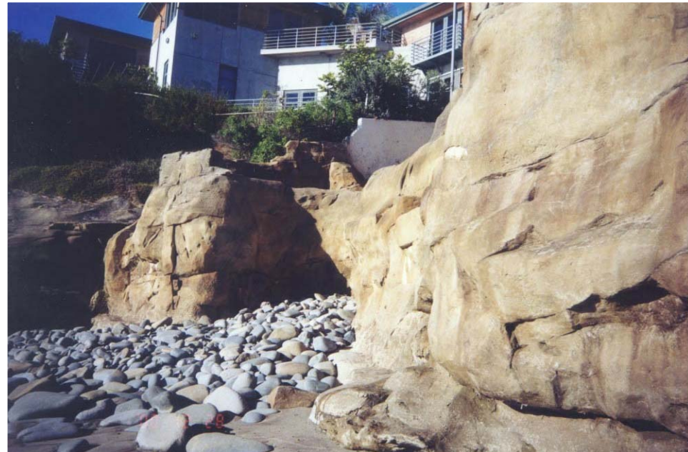
SEAWALL AT 6102 CAMINO DE LA COSTA SHOWING THE PROPOSED COLOR, TEXTURE AND SCULPTING PROPOSED